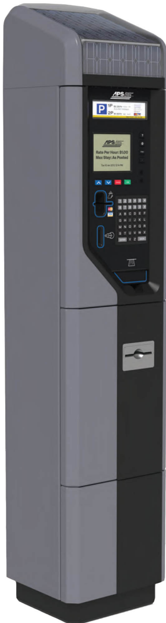
(Pay by Plate Model shown)